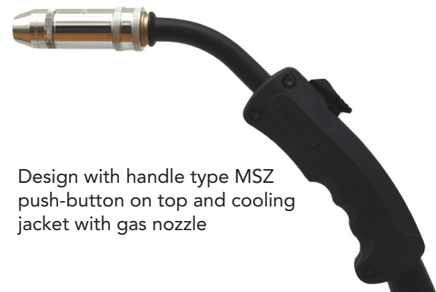
Design with handle type MSZ push-button on top and cooling jacket with gas nozzle