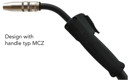
Design with handle typ MCZ