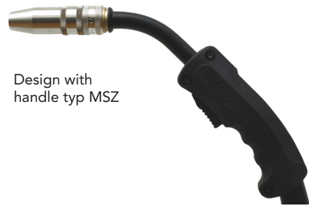
Design with handle typ MSZ