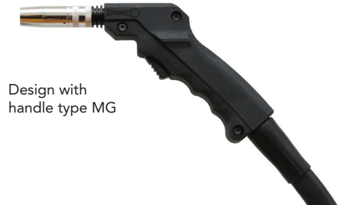
Design with handle type MG