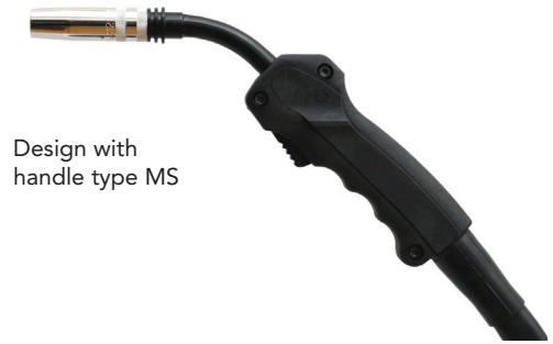
Design with handle type MS