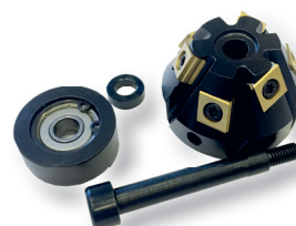
Art. Nr. 27223