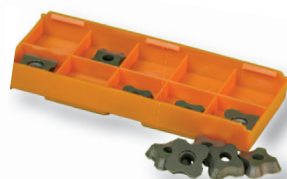
Art. Nr. 26109