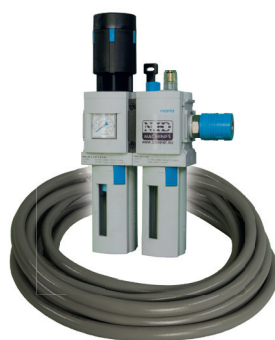
Art. Nr. 27221