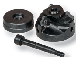
Art. Nr. 27234