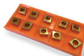
Art. Nr. 27231