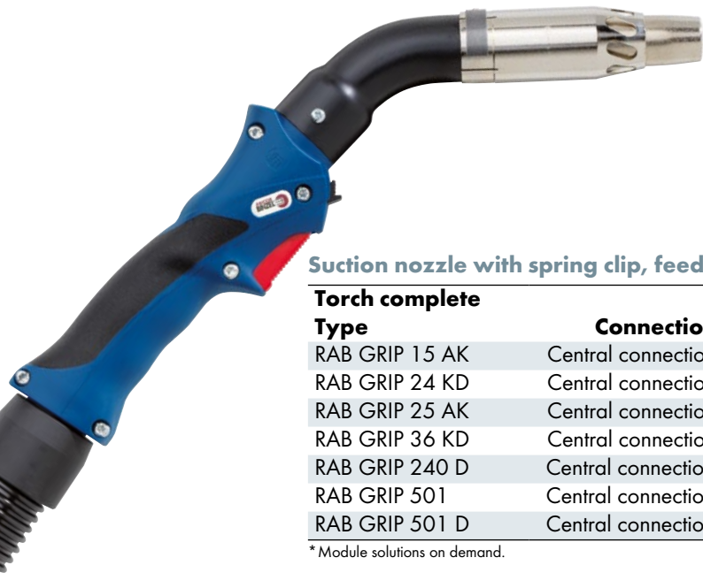
Suction nozzle with spring clip, feed air slide below*