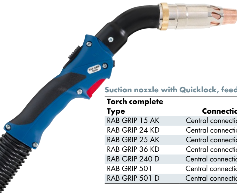
Suction nozzle with Quicklock, feed air slide on top