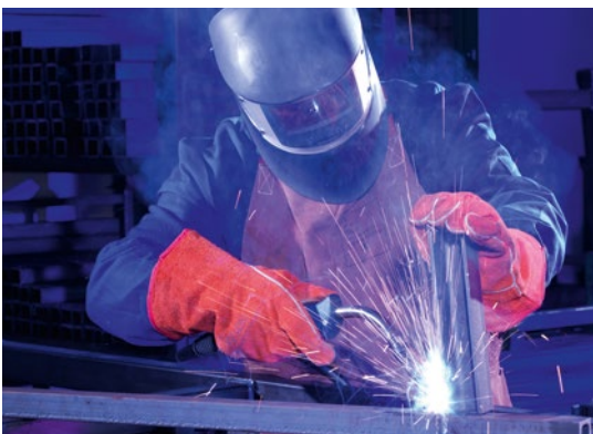
MIG/MAG without fume extraction