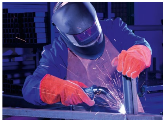
RAB GRIP with fume extraction