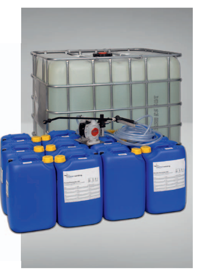
Avesta FinishOne Passivator 630 helps speeding up the thickness of the passive layer.

Avesta Cleaner 401 can be used together with Avesta FinishOne Passivator 630, which helps regenerate the protective layer in the stainless steel by speeding up the thickness of the passive layer.