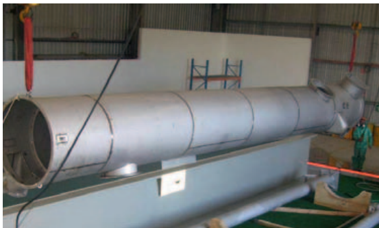
Immersion of an object into a pickling bath yields the best pickling result.