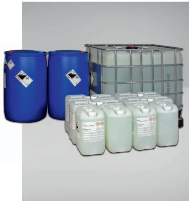
Avesta Pickling Bath 302 is a concentrate ready to mix depending on which stainless steel grade you need to pickle.

Very high alloyed grades, such as super-austenitic (254 SMO) and super-duplex (2507) grades: Mix 1 part of 302 into 1 part of water.